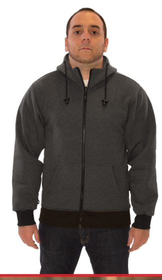
Zip-Up Sweatshirt $78114 Charcoal Gray -Zipper Closure -Hooded S - 3XL