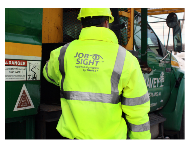
Reflective Heat Transfer