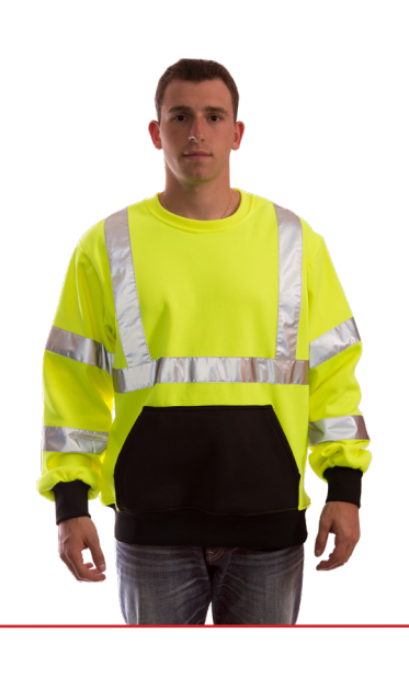
Crew Neck $78022 Fluorescent Yellow-Green S - 5XL

Pullover Hoodie $78322 Fluorescent Yellow-Green -Hooded S - 5XL