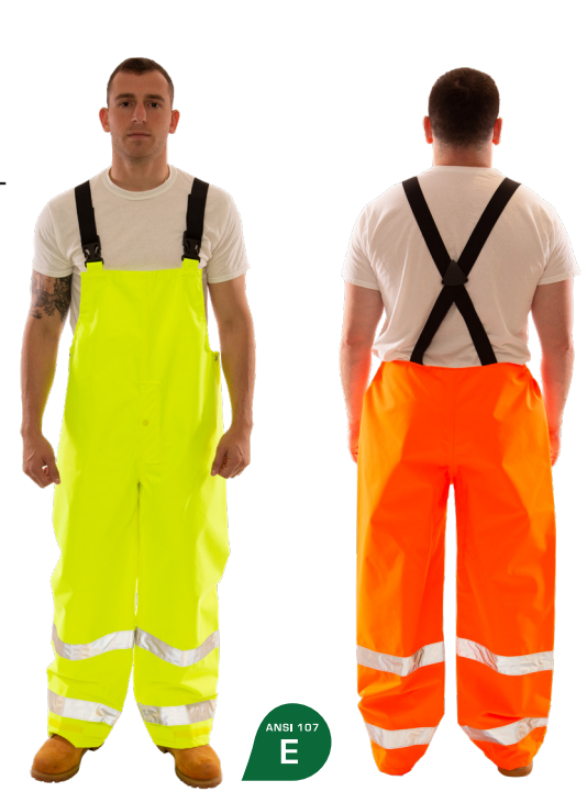
Icon Pants P24123 Black -Snap Fly Front S - 5XL

Fluorescent Orange-Red -Snap Fly Front S - 5XL