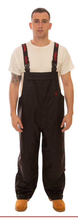
Icon Overall O24113 Black - Snap Fly Front S - 3XL