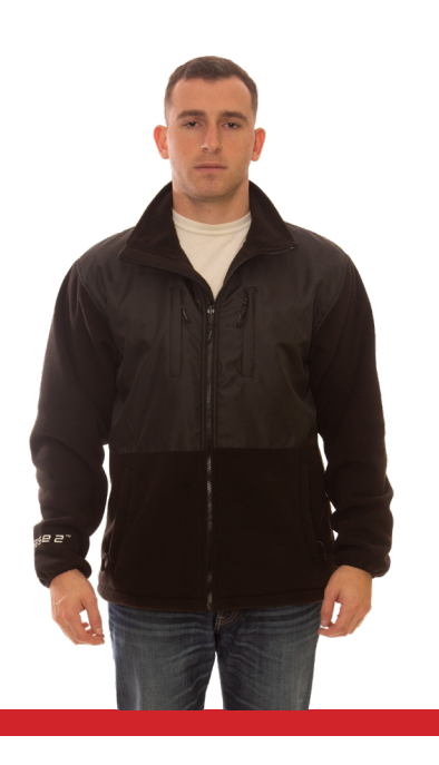
Phase 2 Fleece Jacket J73013 Black Collared S - 3XL

Phase 3 Soft Shell Jacket J25013 Black Collared S - 3XL