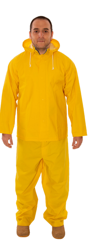
Overall O53107 Yellow Snap Fly Front S - 3XL