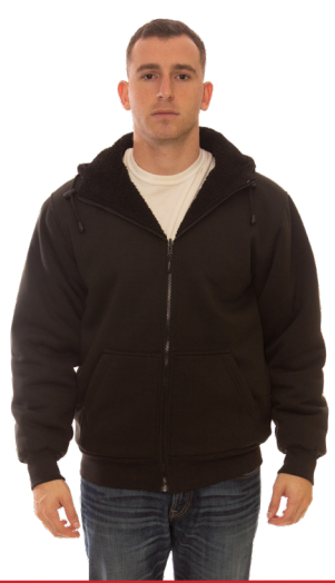
Insulated Sweatshirt S78143 Black -Hooded S - 3XL