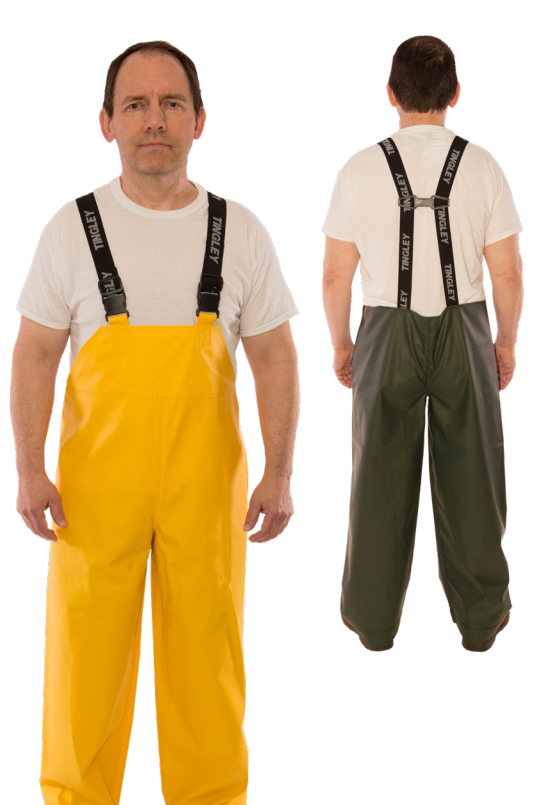
O33017 Yellow -Plain Front S - 3XL