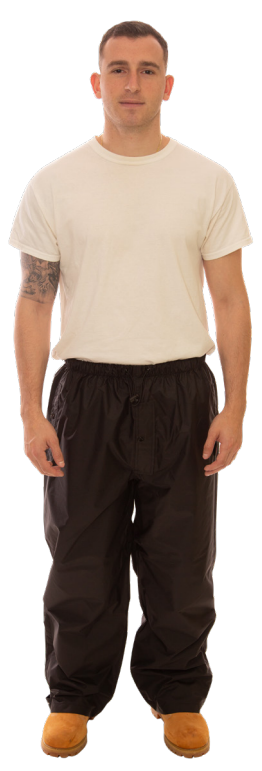
Icon LTE Pants P27113 Black - Snap Fly Front S - 3XL