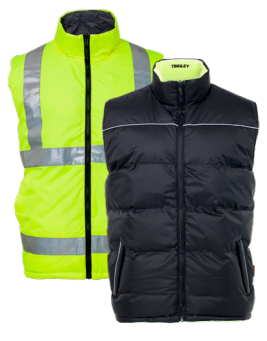
Reversible Insulated Vest