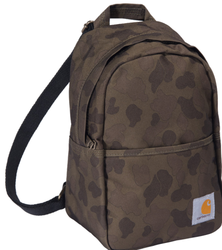
B0000402-903 Duck Camo