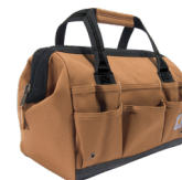
B0000351-201 Carhartt Brown