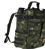
B0000419-901 Blind Fatigue Camo