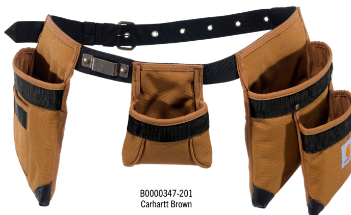
B0000347-201 Carhartt Brown