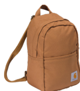
Classic Mini Backpack B0000279