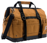
18-Inch Molded Base Heavyweight Tool Bag B0000354