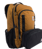
B0000368-201 Carhartt Brown