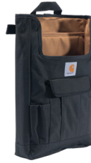
Front Seat Car Organizer B0000317