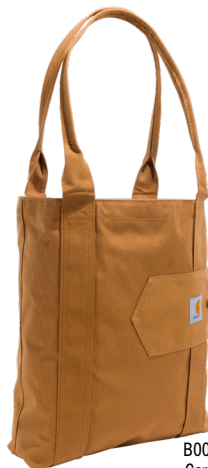
B0000378-201 Carhartt Brown