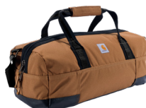
35L Classic Duffel B0000334