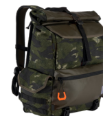
B0000418-901 Blind Fatigue Camo