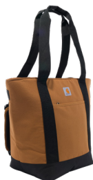
Insulated 40 Can Backpack Tote B0000258