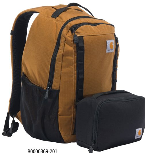
B0000369-201 Carhartt Brown