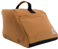
Short Boot Bag B0000311