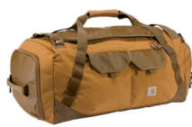
70L Nylon Heavy-haul Duffel B0000422