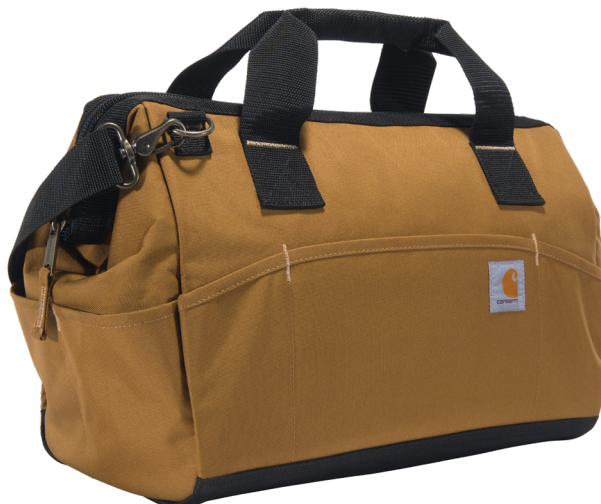
B0000350-201 Carhartt Brown