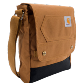
B0000377-201 Carhartt Brown