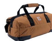
B0000334-201 Carhartt Brown