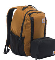
Cargo Series 20L Daypack + 3 Can Cooler B0000369