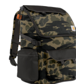
B0000443-901 Blind Duck Camo