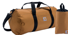
40L Lightweight Duffel + Utility Stash Pouch B0000333