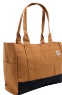
Horizontal Zip Tote B0000379