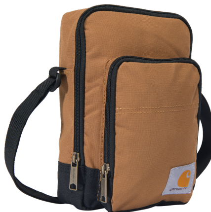
B0000305-201 Carhartt Brown