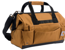
16-Inch 30 Pocket Heavyweight Tool Bag B0000352