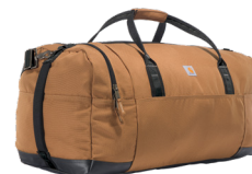
B0000336-201 Carhartt Brown