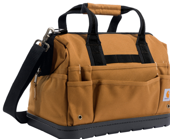
B0000353-201 Carhartt Brown