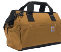
16-Inch 17 Pocket Midweight Tool Bag B0000350