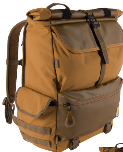
B0000418-201 Carhartt Brown