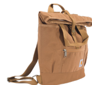
B0000382-201 Carhartt Brown