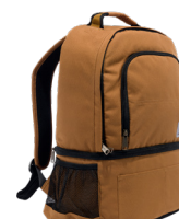
B0000303-201 Carhartt Brown