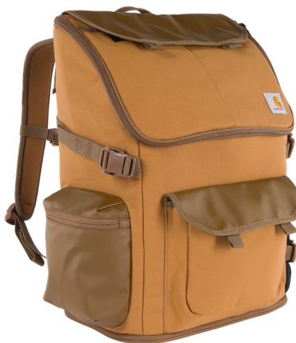
B0000443-211 Carhartt Brown