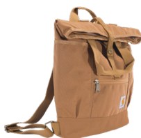
Convertible Backpack Tote B0000382