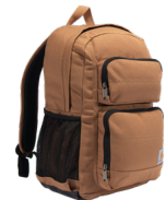
B0000273-201 Carhartt Brown