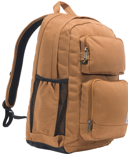
B0000278-201 Carhartt Brown