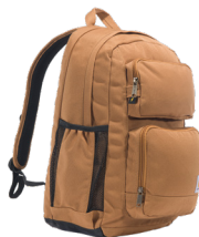
28L Dual-Compartment Backpack B0000278