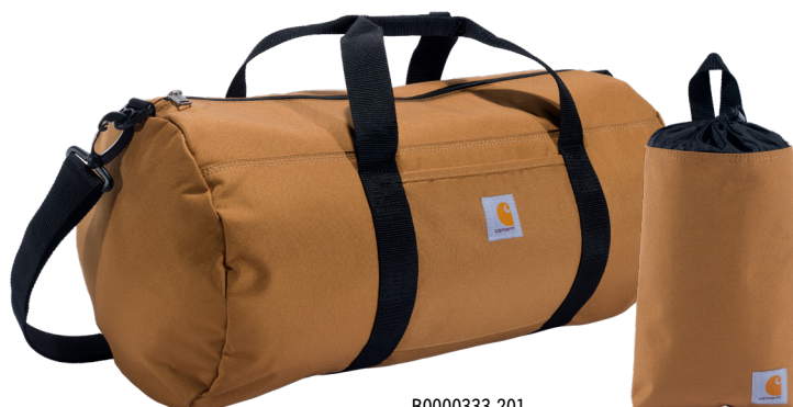
B0000333-201 Carhartt Brown