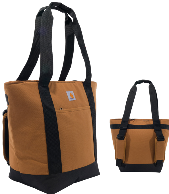
B0000258-201 Carhartt Brown