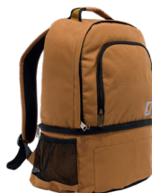
Insulated 24 Can Two Compartment Cooler Backpack B0000303