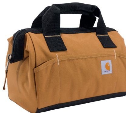
B0000399-201 Carhartt Brown