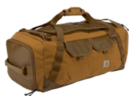
55L Nylon Heavy-haul Duffel B0000421