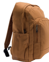
25L Classic Laptop Backpack B0000279