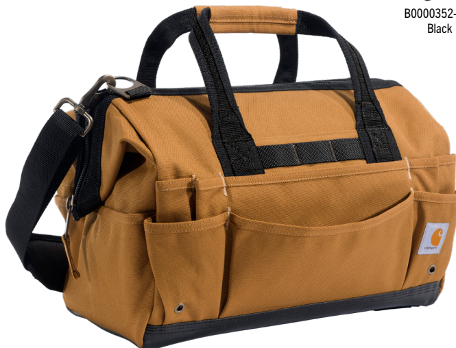
B0000352-201 Carhartt Brown