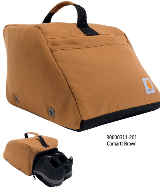
B0000311-201 Carhartt Brown