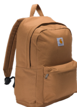
21L Classic Laptop Daypack B0000280