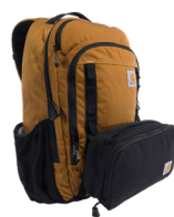
Cargo Series 25L Daypack + 3 Can Cooler B0000368