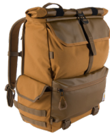
40L Nylon Roll Top Backpack B0000418