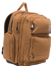
35L Triple-Compartment Backpack B0000277