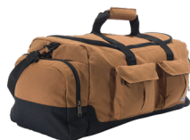
40L Utility Duffel B0000325