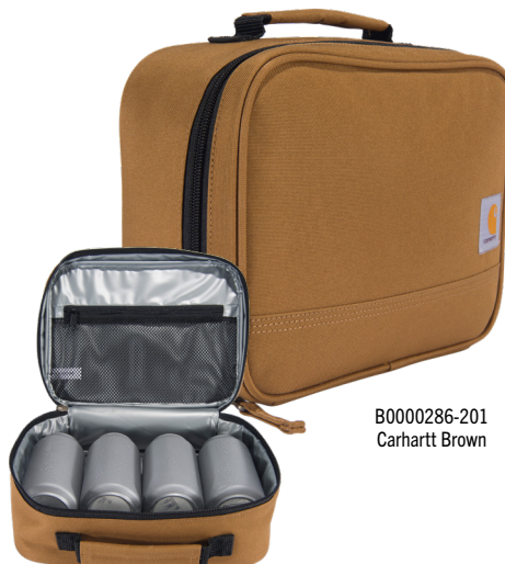
B0000286-201 Carhartt Brown