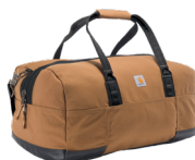
55L Classic Duffel B0000335