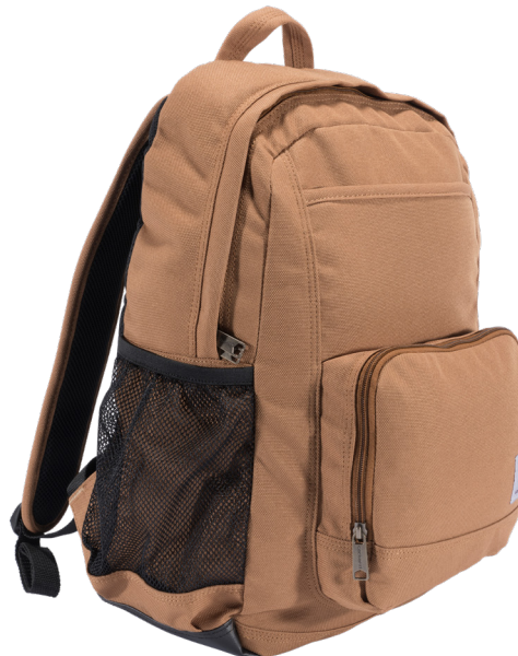
B0000275-201 Carhartt Brown