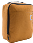
Cargo Series Insulated 4 Can Lunch Cooler B0000373