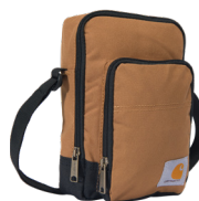
Crossbody Zip Bag B0000305