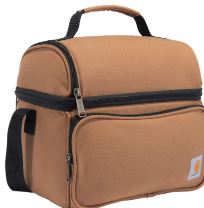
B0000304-201 Carhartt Brown