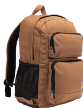
27L Single-Compartment Backpack B0000273