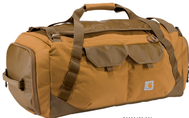
B0000422-201 Carhartt Brown