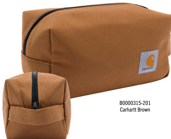
B0000315-201 Carhartt Brown