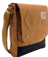
Crossbody Snap Bag B0000377