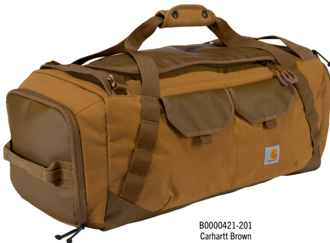
B0000421-201 Carhartt Brown