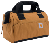
13-Inch 15 Pocket Midweight Tool Bag B0000399