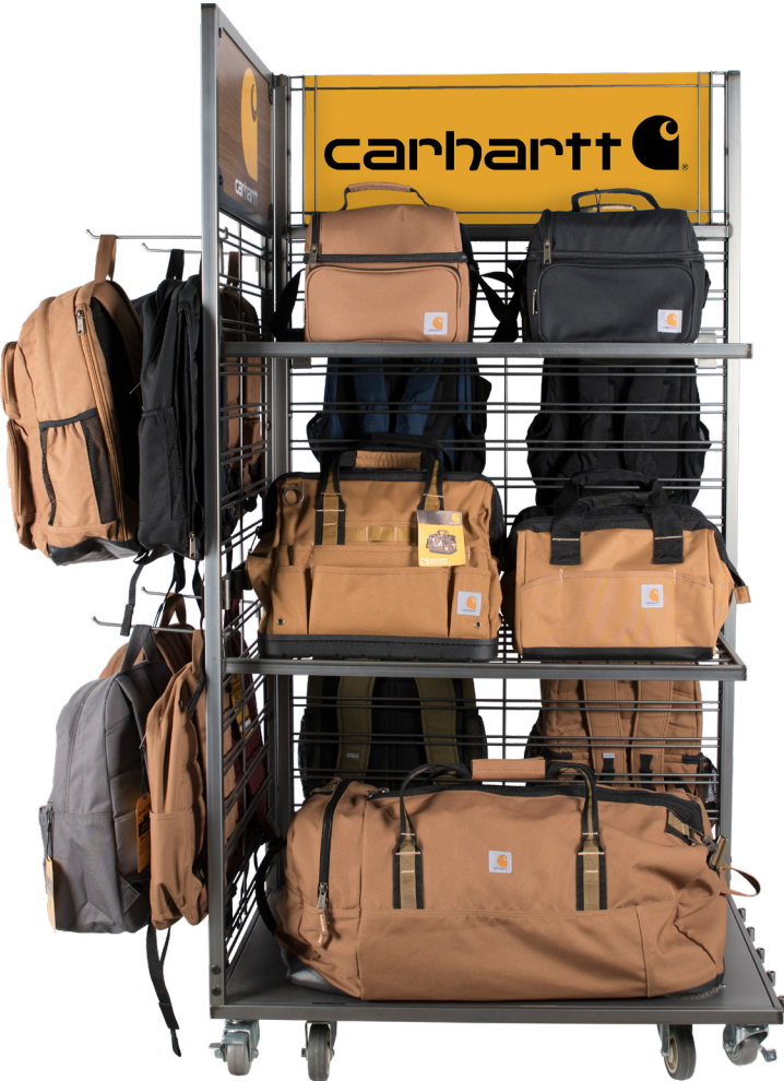
DISPLAY 38" X 26" X 71"