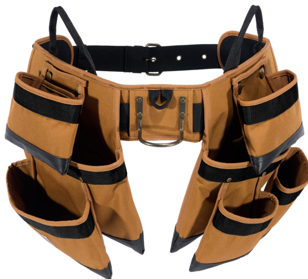
B0000349-201 Carhartt Brown