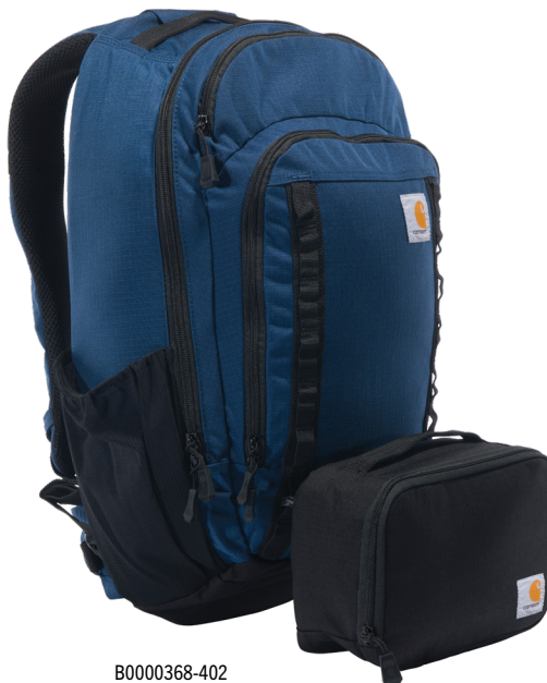
B0000368-402 Dark Blue