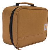
Insulated 4 Can Lunch Cooler B0000286