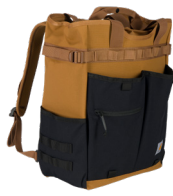
28L Nylon Cinch-top Convertible Tote Backpack B0000419