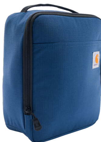
B0000373-402 Dark Blue