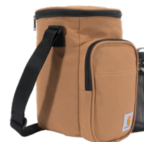
B0000288-201 Carhartt Brown