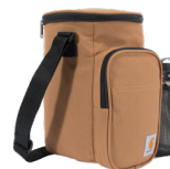
Insulated 10 Can Vertical Cooler + Water Bottle B0000288