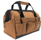
14-Inch 25 Pocket Heavyweight Tool Bag B0000351