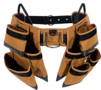
11 Pocket Padded Tool Belt B0000349