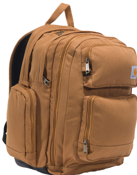
B0000277-201 Carhartt Brown