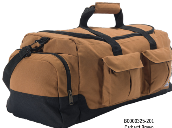
B0000325-201 Carhartt Brown