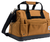
16-Inch Molded Base Heavyweight Tool Bag B0000353