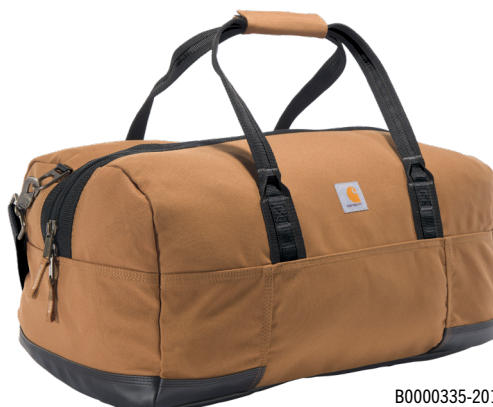
B0000335-201 Carhartt Brown