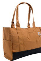
Horizontal Zip Tote B0000379