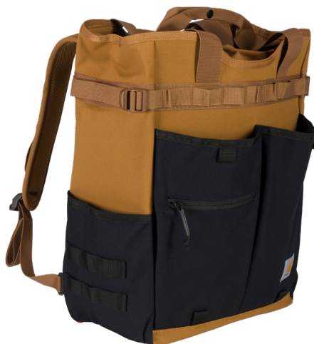
B0000419-201 Carhartt Brown