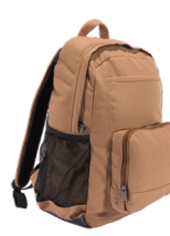
23L Single-Compartment Backpack B0000275