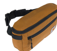
B0000371-201 Carhartt Brown