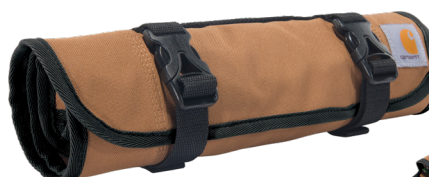
B0000355-201 Carhartt Brown