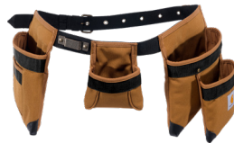
7 Pocket Tool Belt B0000347