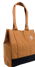
B0000380-201 Carhartt brown