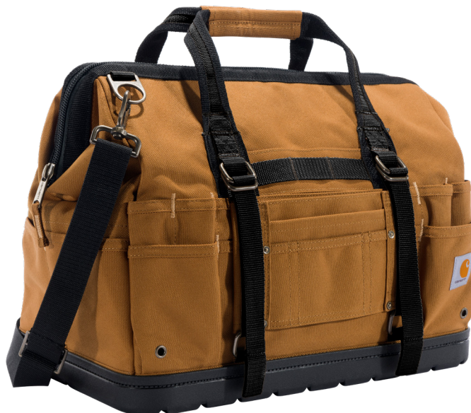
B0000354-201 Carhartt Brown