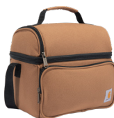
Insulated 12 Can Two Compartment Lunch Cooler B0000304