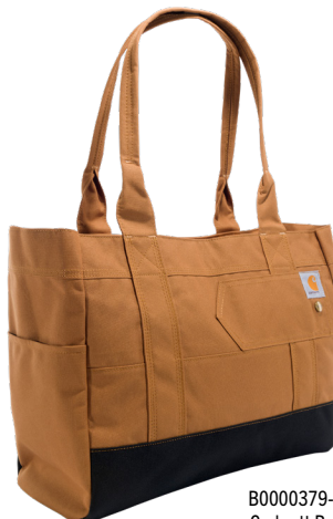
B0000379-201 Carhartt Brown